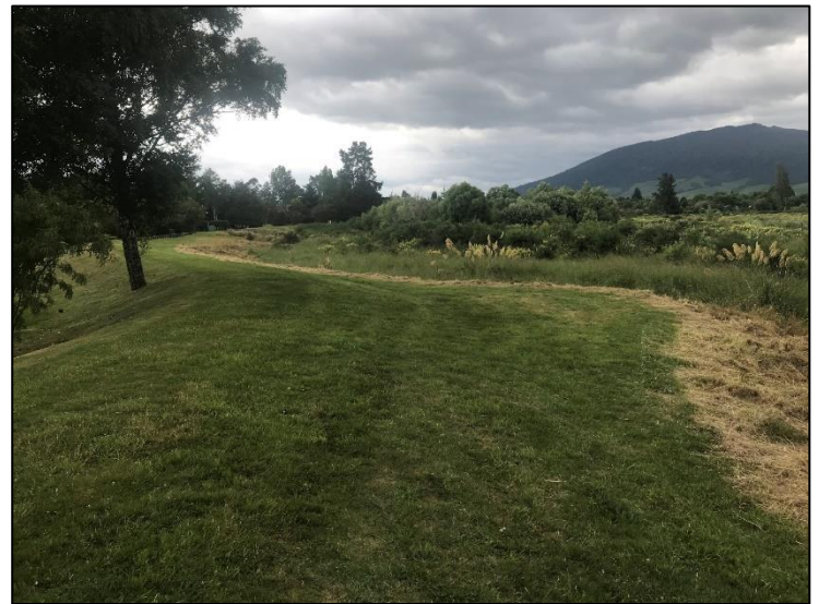
Figure 3: Manually removed vegetation at the toe of the Grace Rd to SH1 Bridge Stop Bank with the invasive vegetation on the flood plain behind spot sprayed.