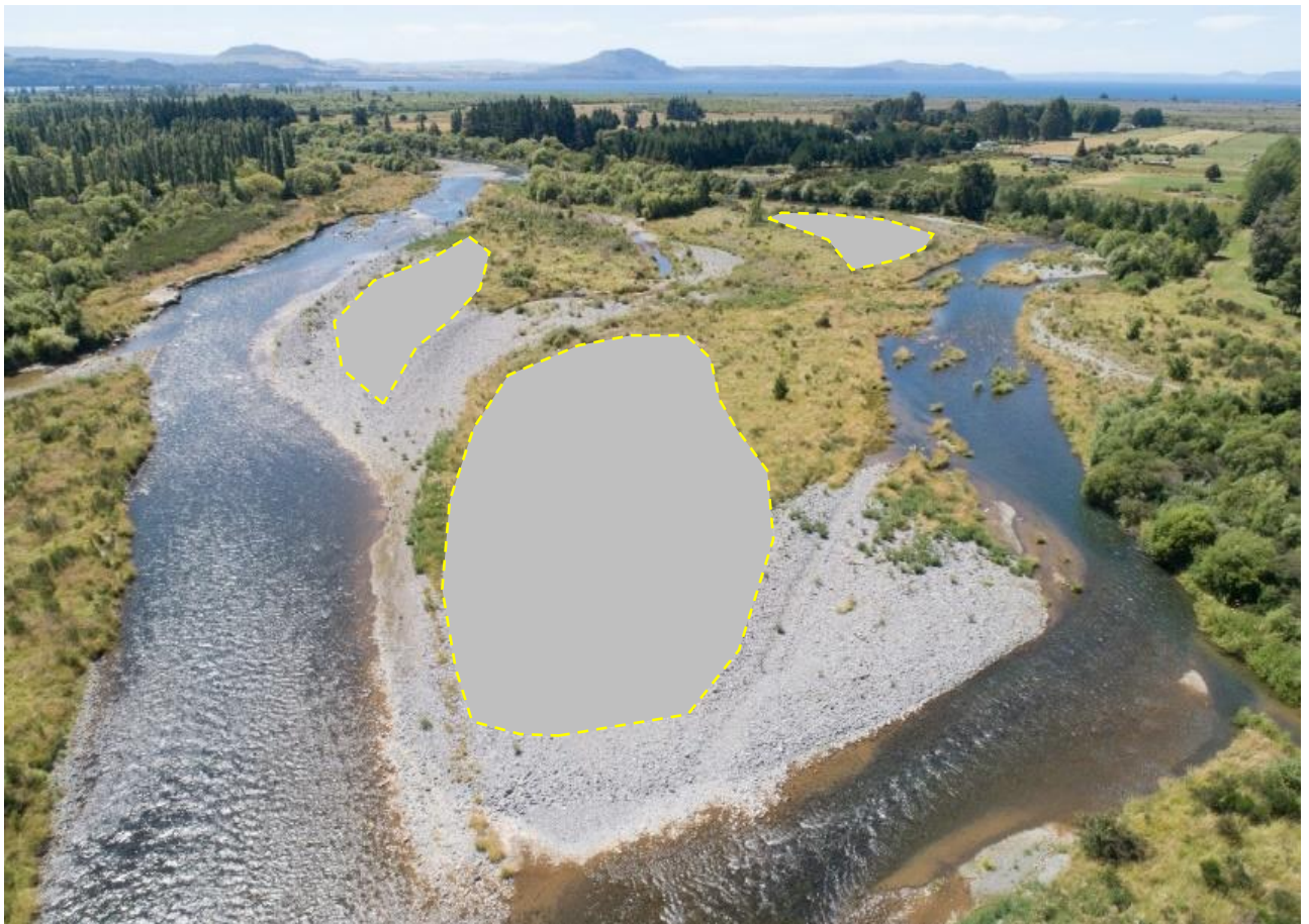
Figure 4: Island adjacent Kohineheke Reserve. Grey: Built up areas requiring lowering to annual average flow level.

The focus is to remove gravel from the built areas down to annual average flow level (Figure 2), leaving a buffer strip undisturbed. This will increase water holding capacity, without affecting the hydrology of the wet river channels and reduce the potential for sediment release. Machines and trucks will enter the island by a causeway over the true right channel to avoid river crossings, to reduce elevating sediment discharges. The causeway will be installed from the Grace Rd fishing access area and removed post works.