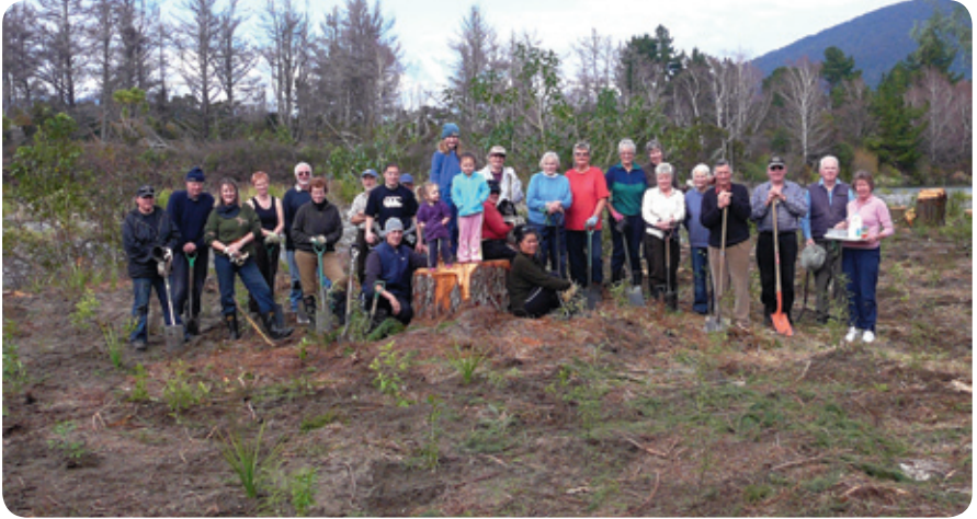
Planting morning, 22 August 2009.

This group planted some 1,000 shrubs and trees on a portion of the riverbank near Taupahi Reserve in little more than 90 minutes. The land had been cleared of weeds under the Advocates' supervision as part of a planting project that links the path from the Birches Bridge to Te Aho Reserve. Further preparatory work (tree felling, spraying blackberry, slashing and clearing undergrowth) is under way, and some 3,000 plants in DoC's Turangi depot will go in this winter.