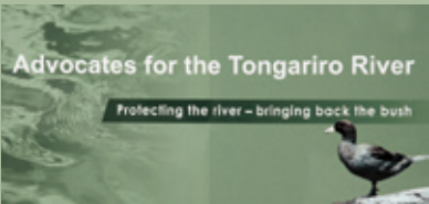
Part of a Department of Conservation sign acknowledging the environment restoration efforts of AFTR.

The postal address is PO Box 335 Turangi 3353 Contact can be made through our website www.tongariroriver.org.nz