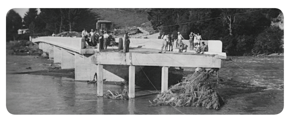
The bridge was untouched