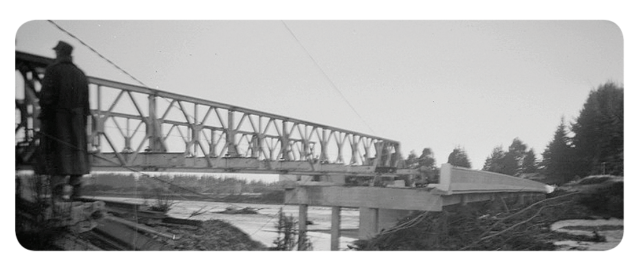
The Army engineers were called in to put in a Bailey Bridge