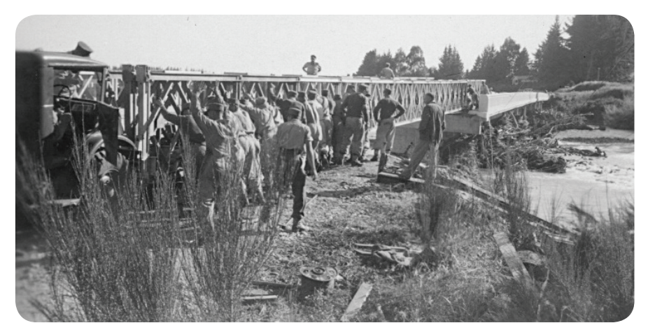
Locals were employed to assist