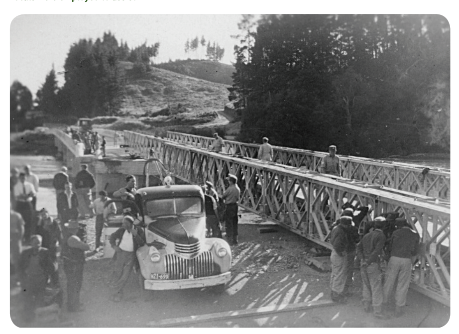
Last check before opening