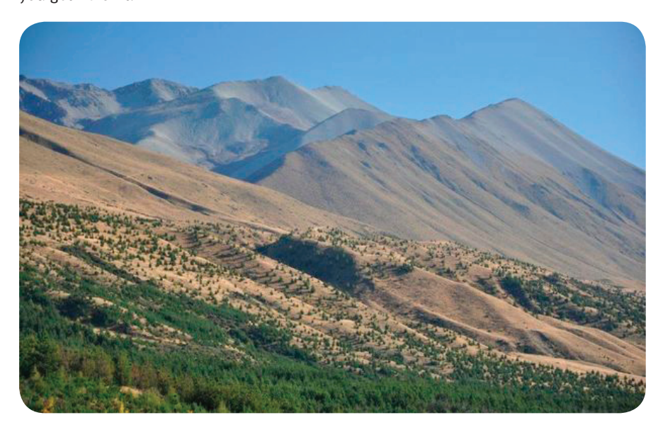
Wilding pines spread near Lake Pukaki in the Mackenzie Basin

If your Christmas tree is browning up at the edges and it's time for it to go, the Department of Conservation (DOC) wants you to think carefully about how you get rid of it.