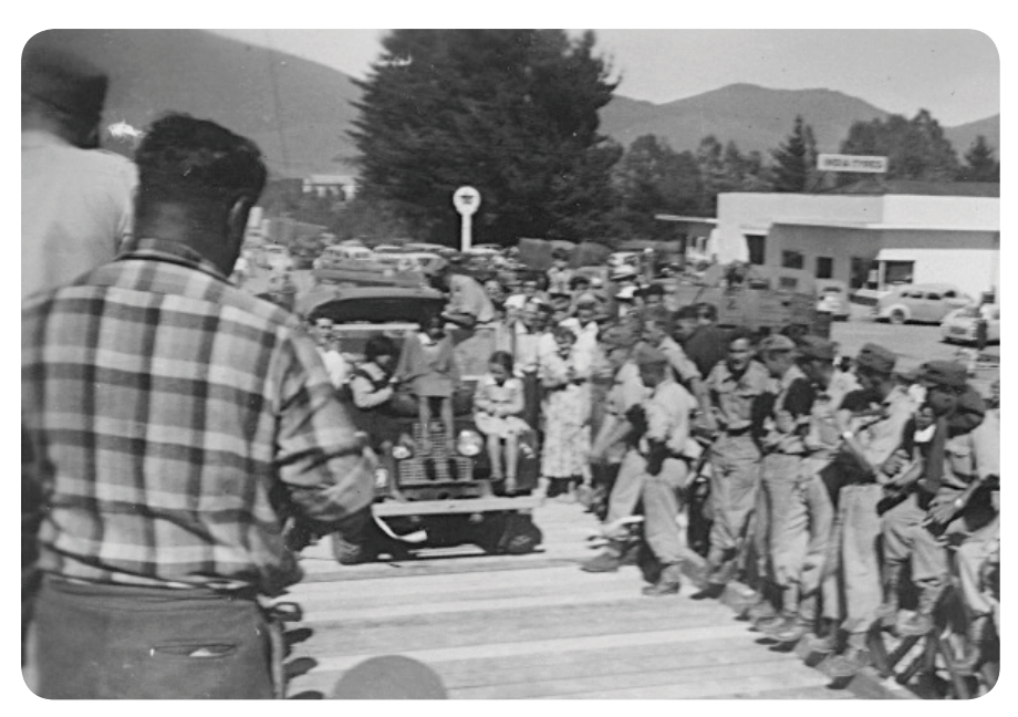
The official re opening