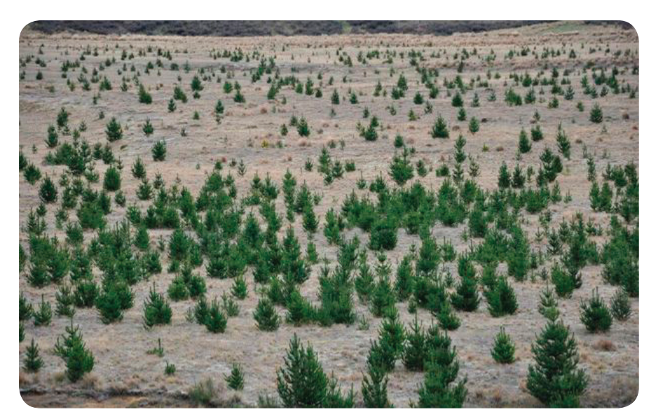
Wilding pines invade farmland on Molesworth Station